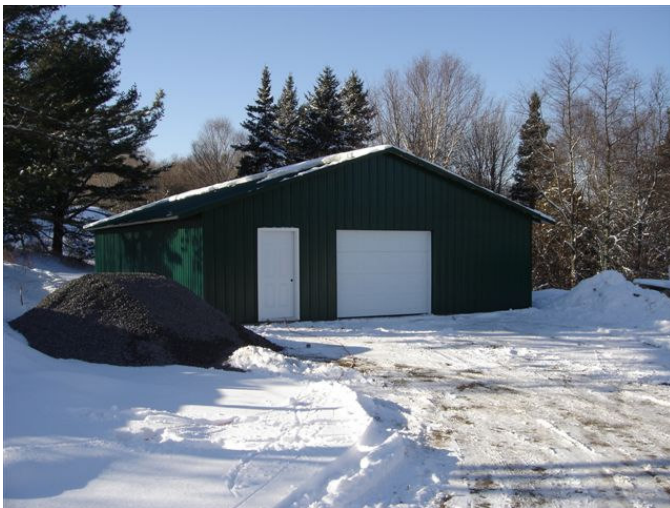
Westfield's New Power Cart Storage Shed

Please see my note on the following page as well for an important update on Club Management. This interim step will allow the Board to take the time required to fully consider the Club's organizational structure and identify the necessary skills and resources required before seeking any long-term permanent solutions.